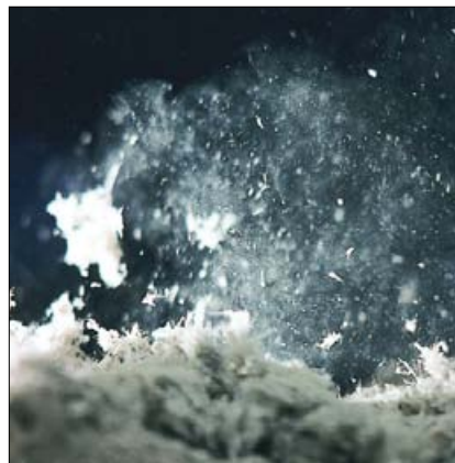
Don't create dust if you can avoid it