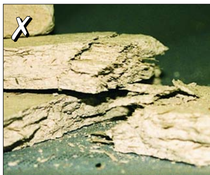
Damaged asbestos insulating board