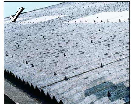
Asbestos cement sheets or guttering