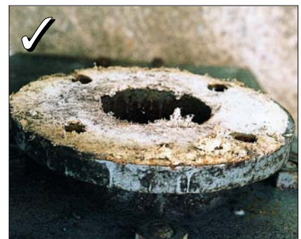
Gaskets or rope seals

If you have any doubts, carry out a risk assessment (see 'More help') or ask the client to employ an HSE-licensed asbestos contractor.