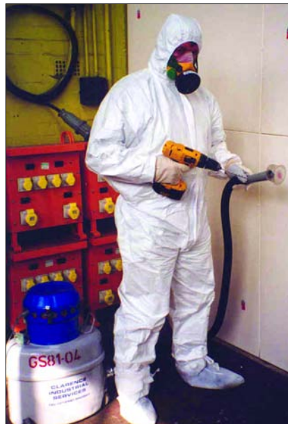
Using a Class H vacuum cleaner and a drill cowl