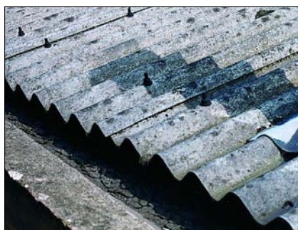
AC sheets used as roofing