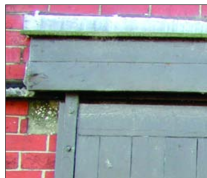
Built up bituminous roofing and bituminous asbestos fabric over a doorway