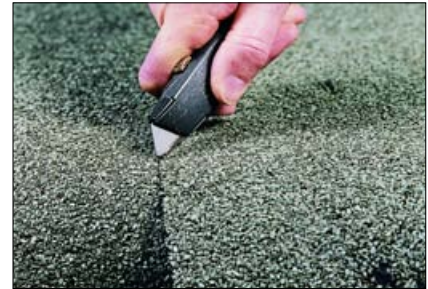
Cut and remove manageable sections