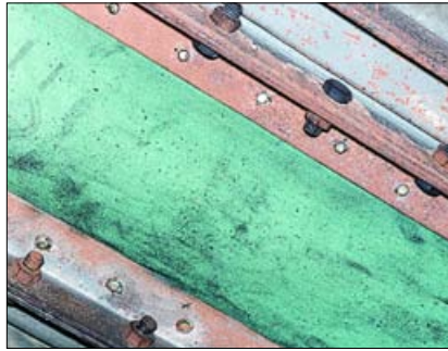
Riveted connector detail

There may also be other hazards - you need to consider them all.