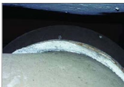
Joint packing on a flue