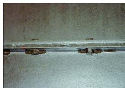
String gasket between metal sheets