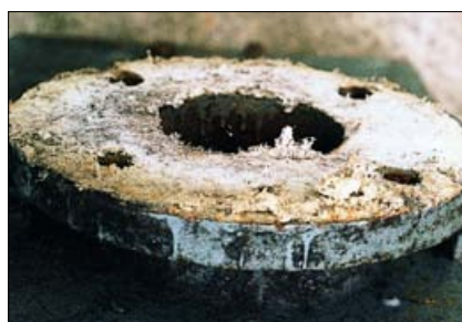
Gasket material left on a pipe flange