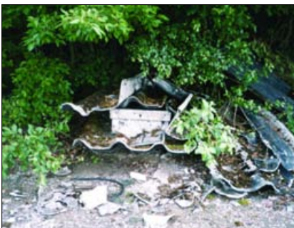
Asbestos cement sheets discarded irresponsibly