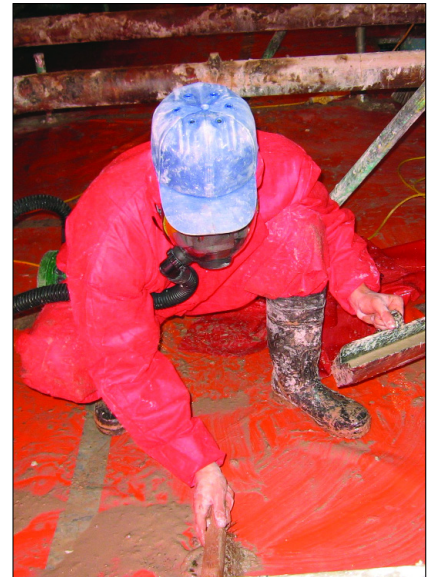
Over-wetting the material creates a waste slurry which will be difficult to clean up

This guidance is issued by the Health and Safety Executive. Following the guidance is not compulsory and you are free to take other action. But if you do follow the guidance you will normally be doing enough to comply with the law. Health and safety inspectors seek to secure compliance with the law and may refer to this guidance as illustrating good practice.