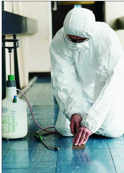
Spray at low pressure; high pressure spray could disturb fibres from asbestos paper under these tiles