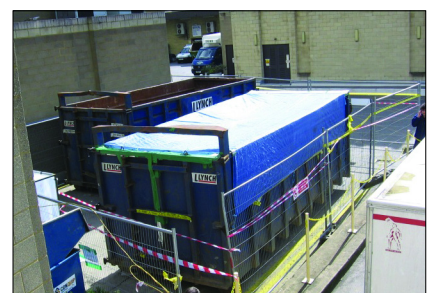
It is not good enough to throw sheeting over a standard skip

This guidance is issued by the Health and Safety Executive. Following the guidance is not compulsory and you are free to take other action. But if you do follow the guidance you will normally be doing enough to comply with the law. Health and safety inspectors seek to secure compliance with the law and may refer to this guidance as illustrating good practice.