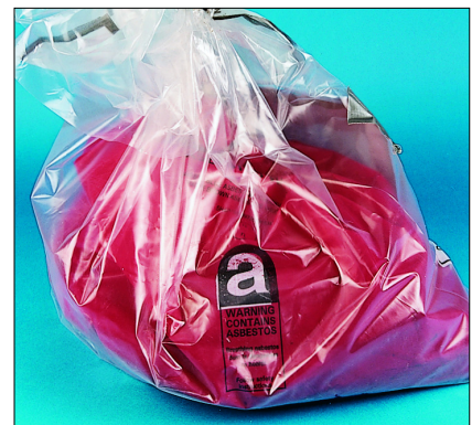
All waste should be double-bagged or double-wrapped in plastic sheeting, with the correct hazard warning signs attached.