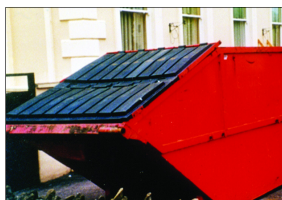
Use a lockable skip for asbestos cement sheet