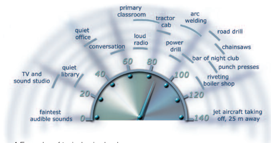
Figure 1 Examples of typical noise levels

Some examples of typical noise levels are shown in Figure 1. This shows that a quiet office may range from 40-50 dB, while a road drill can produce 100-110 dB.